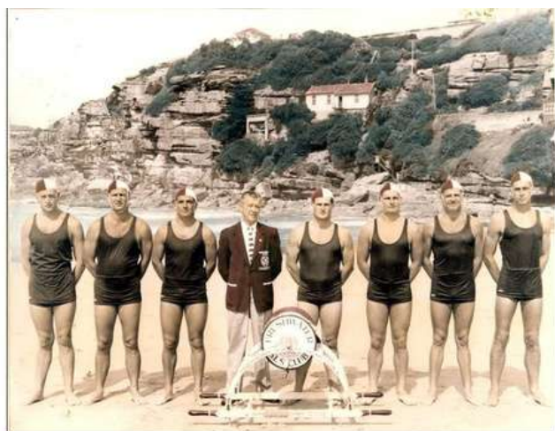
1958-1959, 1959-1960 AUSTRALIAN SENIOR RESCUE & RESUSCITATION CHAMPIONS MOOLOOABA / MEREWETHER