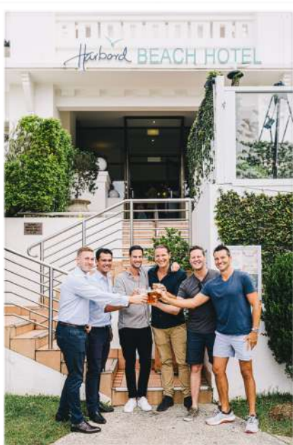
New owners of Harbord Beach Hotel

Because of the social distancing limitations in force as a result of COVID-19, it is most unlikely the club's Annual General Meeting will take place on its usual date of the last Sunday of June. As restrictions slowly ease, it is hoped we may be able to hold the AGM early in the new season. The option of conducting the meeting by use of technology such as Zoom will also be considered if social distancing requirements continue to prevent members from attending in person. Notice of the time, date and method of conduct of the AGM will be sent to all members at the relevant time.