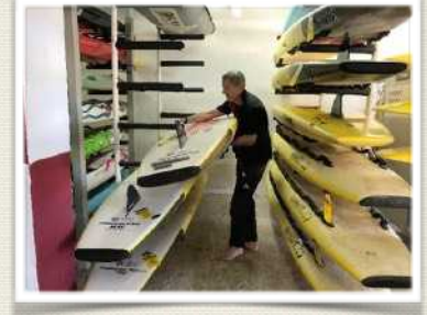
Please help looking after our boards.

The gear repair role is ideal for someone who loves trips to [your favourite hardware store name here]. I enjoyed trips to my favourite hardware