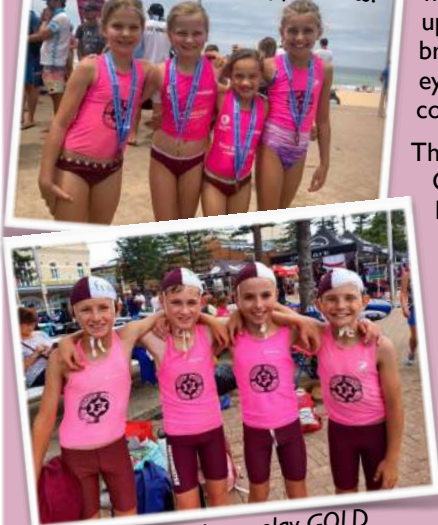
U10 boys relay GOLD at Nipper Nats!