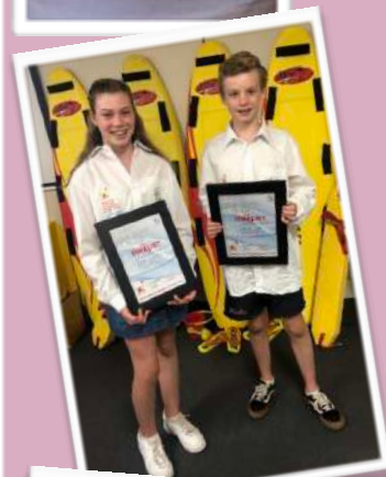
U10 girls Silver at Nipper Nats!