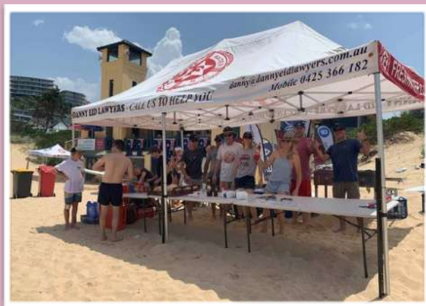
Nippers run Bbq at Freshie Australia Day Carnival - thanks for all your hard work!