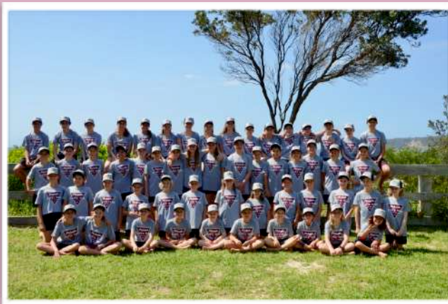
Freshie Nippers State Team!