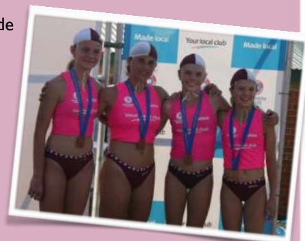
U13 girls BRONZE