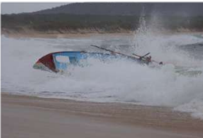
U23 men - winning first semi at state

excellent trips away with great spirit amongst us all. Look forward to planning next season