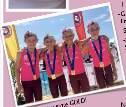
U10 boys relay state GOLD!