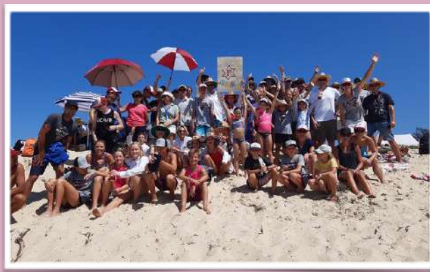
Freshie Nippers State Team!