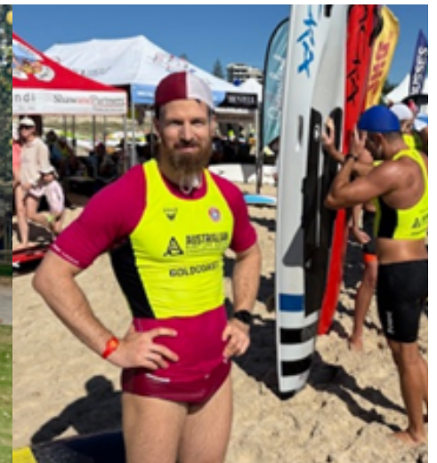
Packed and ready for the 'Aussies adventure'